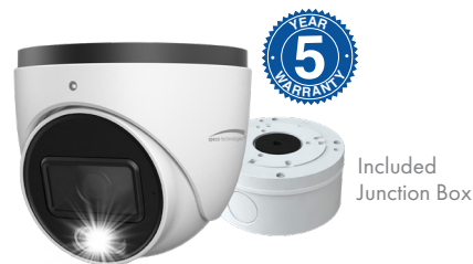
Included Junction Box