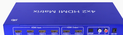
rear of unit