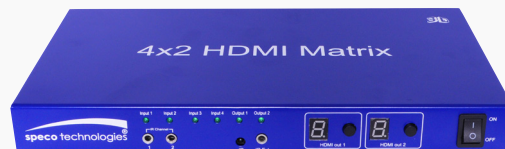
front of unit