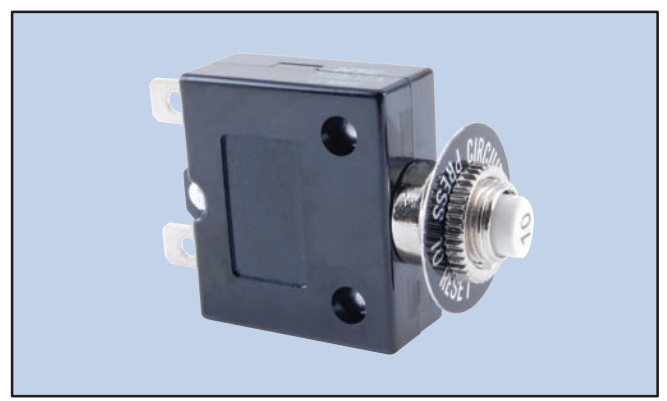
NOTE: Indicator plate shown may NOT be available on all devices.